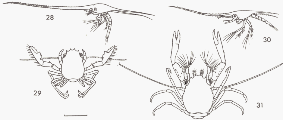
Figs. 28, 29. Porcellana platycheles : 28, zoeal stage I; 29, megalopa. – Figs. 30, 31. Pisidia longicornis : 30, zoeal stage I; 31, megalopa. Scale-line approximately 1 mm: Figs. 28–31.

[Figs. 1–3, 10 after Sars; 8, 15–23, 25–31 after Lebour; 9, 11–14 after Huus; 24 after Bull; 4–7 original R.B.P.].