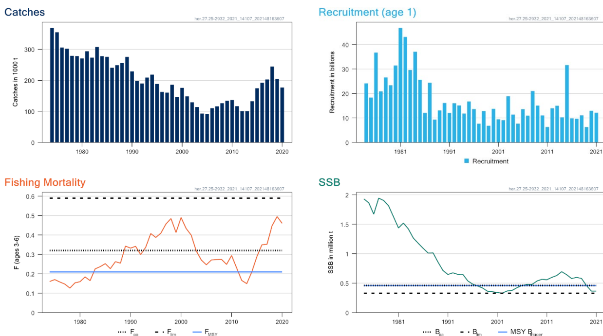
Figure 1 Herring in subdivisions 25–29 and 32, excluding the Gulf of Riga. Summary of the stock assessment. SSB at spawning time in 2021 is predicted.

ICES assesses that fishing pressure on the stock is above F_{MSY} and between F_{pa} and F_{lim} and that spawning-stock size is below MSY B_{trigger} and between B_{pa} and B_{lim} .