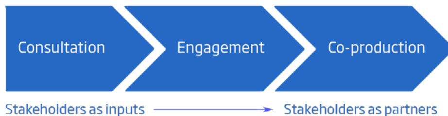
Figure 1. Simplified description of levels of working with stakeholders, adapted from Cvitanovic et al. , 2019.

Working with stakeholders can occur on many levels (Figure 1). This article will focus on the region between engagement and co-production.