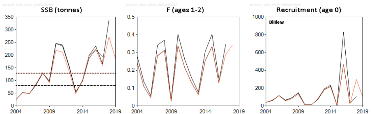
Figure 2 Sandeel in divisions 4.a–b and Subdivision 20, Sandeel Area 3r. Historical assessment results (final-year recruitment estimates included).

In the past there have been large downward revisions of strong year classes. However, F cap may in part take account of some of this uncertainty.