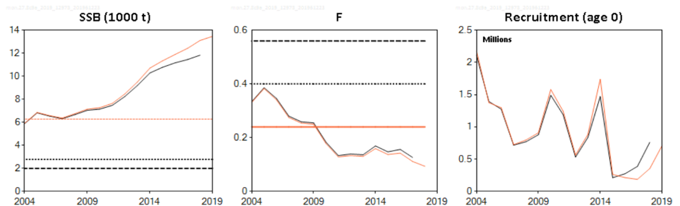
Figure 2 White anglerfish in divisions 8.c and 9.a. Historical assessment results. This stock was benchmarked in 2018.

Despite the low recruitment observed in the last four years a steady increase of SSB was estimated by the model. This can be explained by the delay of 4–5 years for a cohort to recruit to the SSB. The reduction of F in recent years has allowed part of the population to keep growing in size and weight, while also contributing to the increase in SSB.