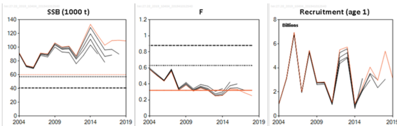
Figure 2 Herring in Subdivision 28.1. Historical assessment results (recruitment in the final year is based on a geometric mean assumption).