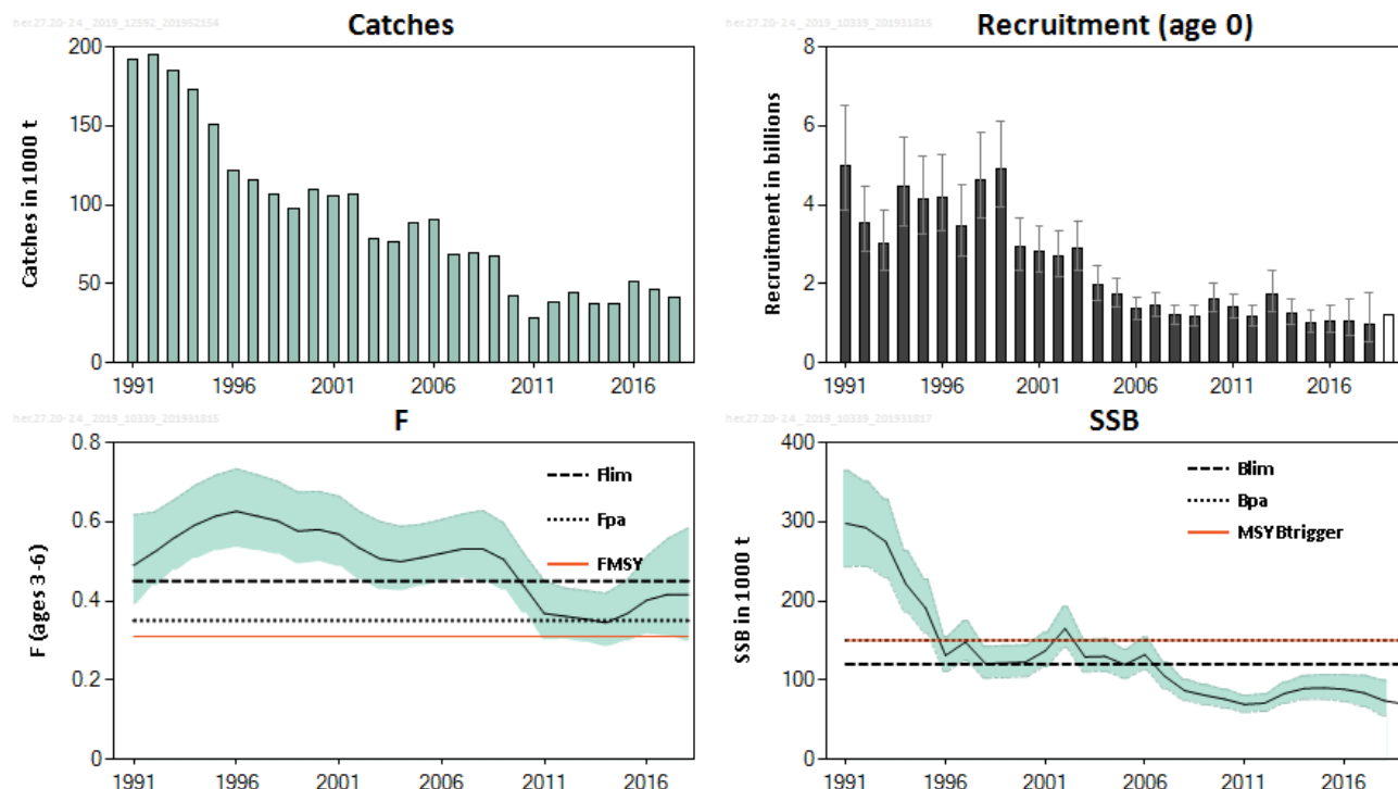
Figure 1 Herring in subdivisions 20–24, spring spawners. Commercial catches, recruitment, fishing mortality (F), and spawning-stock biomass (SSB) from the summary of the stock assessment; 95% confidence intervals are shown for SSB, F, and recruitment. Unshaded value of the recruitment is the average value of 2013–2017 and 2019 SSB (grey diamond) is a predicted number.

The spawning-stock biomass (SSB) has been below B_{lim} since 2007. After a decrease in the first half of the 2010s, fishing mortality (F) has increased since 2014 and remains well above F_{MSY} . Recruitment has been low since the mid-2000s.