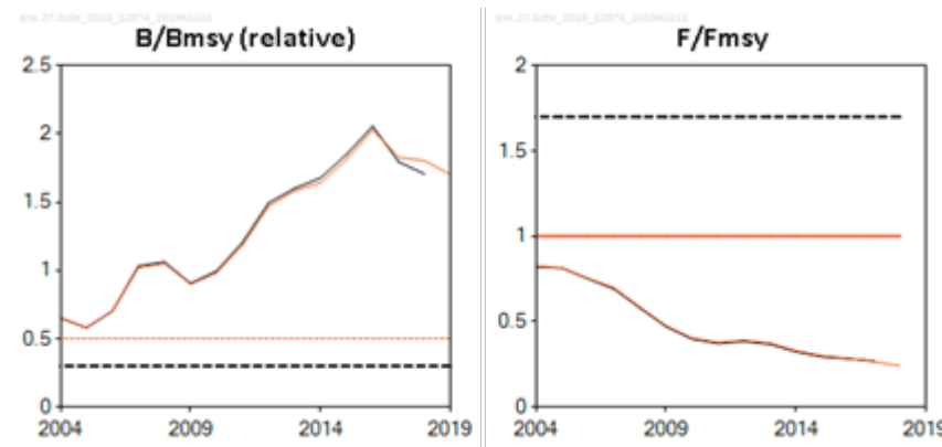
Figure 2 Black-bellied anglerfish in divisions 8.c and 9.a. Relative historical assessment results. This stock was benchmarked in 2018 (ICES, 2018).