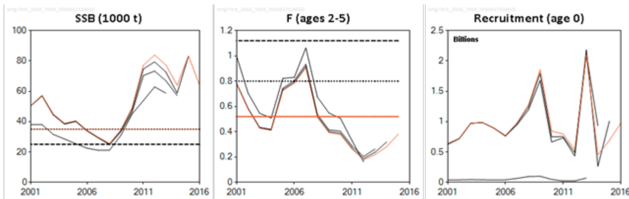
Figure 5.3.68.2 Whiting in divisions 7.b–c, and 7.e–k. Historical assessment results (final-year recruitment estimates included). The 2014 benchmark led to a rescaling of the assessment outputs, particularly recruitment.

This stock was benchmarked in 2014. This year’s assessment is consistent with last year’s.