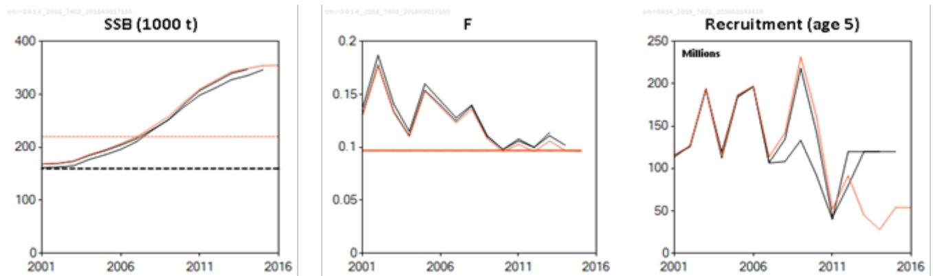
Figure 2.3.14.2 Golden redfish in subareas 5, 6, 12, and 14. Historical assessment results (final-year recruitment estimates included).

Because of the aggregating behavior of the species, survey indices are often largely dominated by a few large hauls. This causes high uncertainties in the survey indices and large interannual fluctuation in estimates of the biomass index. The assessment indicates different stock trends from various data sources, with the catch-at-age data showing a smaller increase in stock size than the survey biomass.