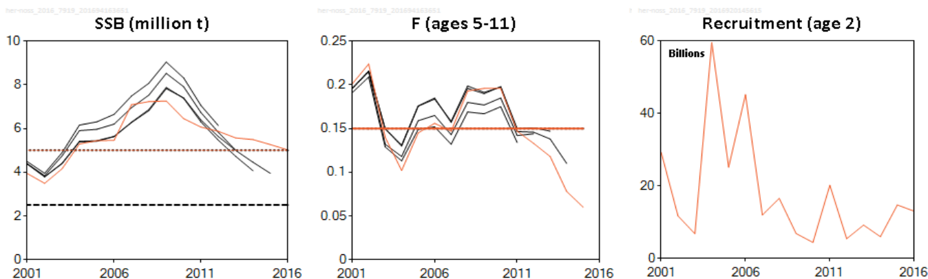
Figure 9.3.33.2 Herring in subareas 1, 2, and 5, and in divisions 4.a and 14.a (Norwegian spring-spawning herring). Historical assessment results (final-year recruitment estimates included). Prior to the 2016 assessment, estimates of F refer to ages 5–14. Recruitment estimates from assessments conducted before 2016 are not shown as they refer to age 0 instead of age 2.

The stock estimates for recent years from exploratory runs with other models are within the confidence intervals of the current assessment.