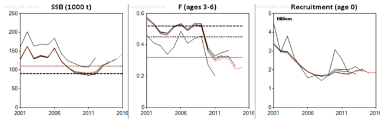
Figure 6.3.17.2 Herring in subdivisions 20–24 (spring spawners). Historical assessment results (final-year recruitment estimates included).

The inherent uncertainty in the predictions is related to the lack of a firm basis to predict the proportions of North Sea autumn spawners (NSAS) and WBSS in the catches taken in divisions 3.a and 4.a East, due to interannual variability in the herring migration patterns and in the distribution of the fisheries (including the optional transfer of quotas between Division 3.a and Subarea 4). In addition, mixing between WBSS and central Baltic herring in subdivisions 22–24 may increase the uncertainty in the assessment.