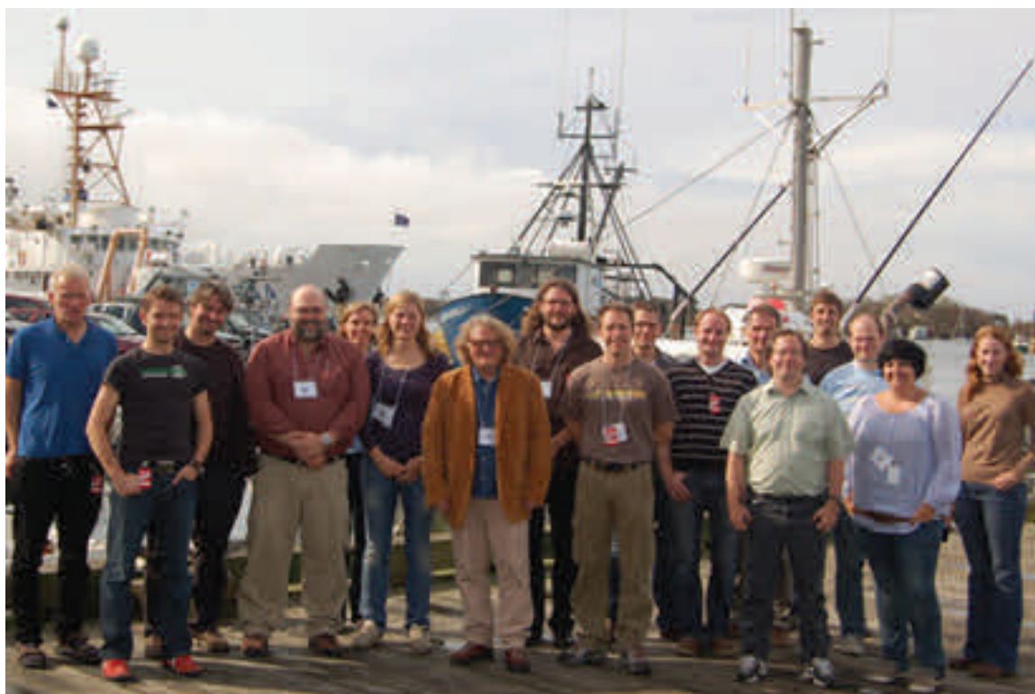
The Working Group On Multispecies Assessment Methods.