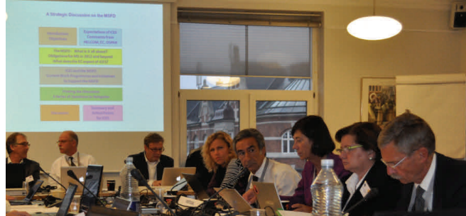
ICES delegates meet at ICES Secretariat.