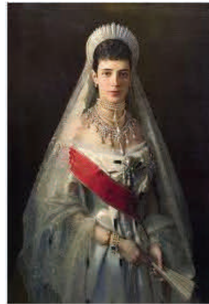
A portrait of Czarina Maria Fyodorovna painted by I. N. Kramskoi in 1882. The portrait might have been painted around Christmas time. We're not sure.