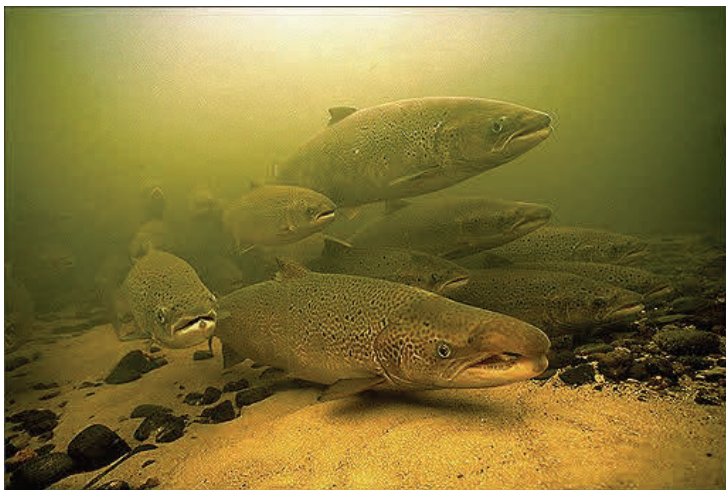
North Atlantic salmon.

Salmon are often heralded as “aquatic canaries”, indicators of healthy aquatic environments. In recent years however, wild Atlantic salmon have been dying at sea in alarming numbers. Southern stocks of salmon on both sides of the Atlantic are facing the very real threat of extinction. Scientists do not yet fully understand the phenomenon, but they are gaining new information, and the recent Salmon at Sea (SALSEA) programme, run by the North Atlantic Salmon Conservation Organization (NASCO), has made major contributions to this knowledge.