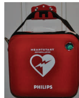
Philips HeartStart First Aid Defibrillator

Every year, ICES Secretariat hosts more than 70 working groups with approximately 1500 visitors. With so many guests, the likelihood of a cardiac emergency increases. Being prepared for an emergency greatly increases a victim's chances of survival. According to the American Heart Association "Less than eight per cent of people who suffer cardiac arrest outside the hospital survive. Unless CPR (cardiopulmonary resuscitation) and defibrillation are provided within minutes of collapse, few attempts at resuscitation are successful".